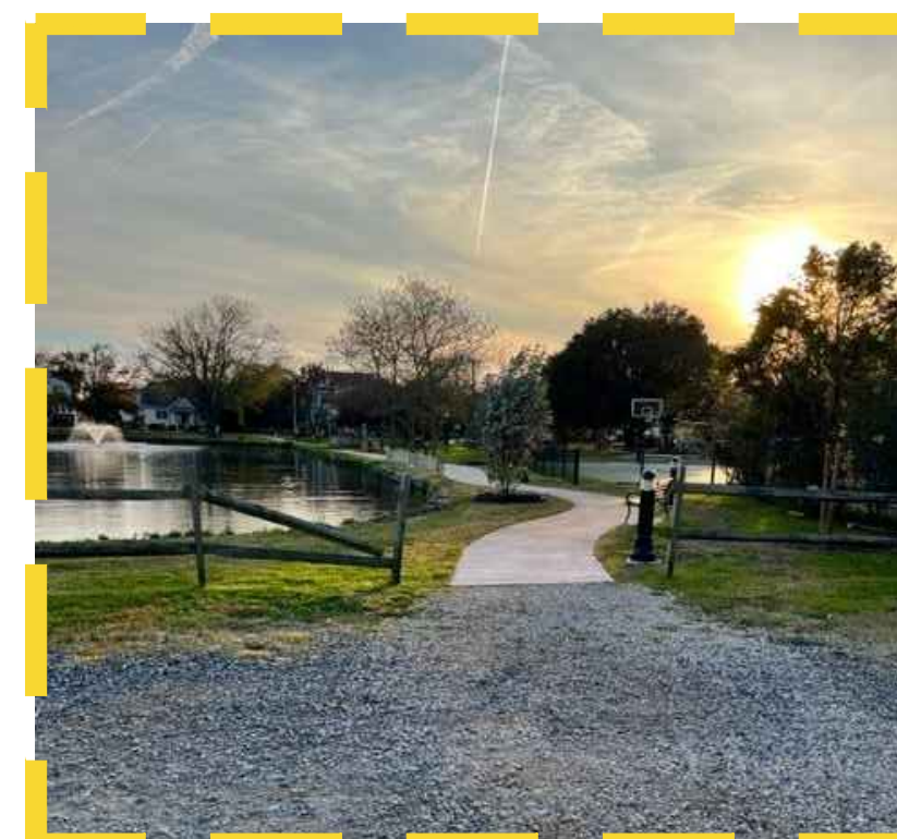
CONSTRUCT 5' SIDEWALK ALONG WEST SIDE OF GRAVEL DRIVE FROM KIWANIS PARK TO ADA ACCESSIBLE TENNIS COURTS