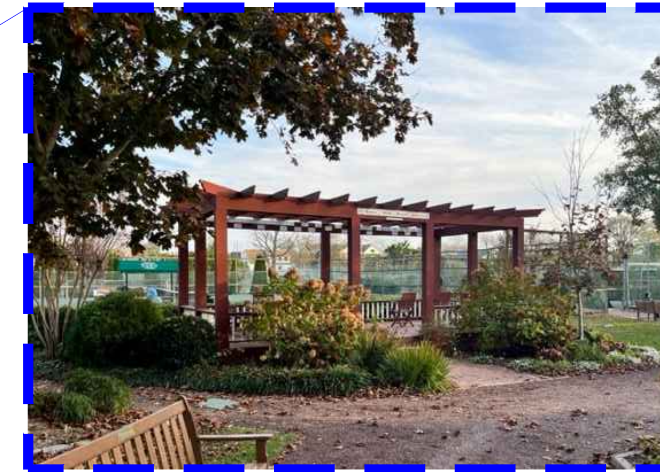
EXISTING VIEWING PAVILION CONSTRUCT ADA ACCESSIBLE RAMP TO PAVILION