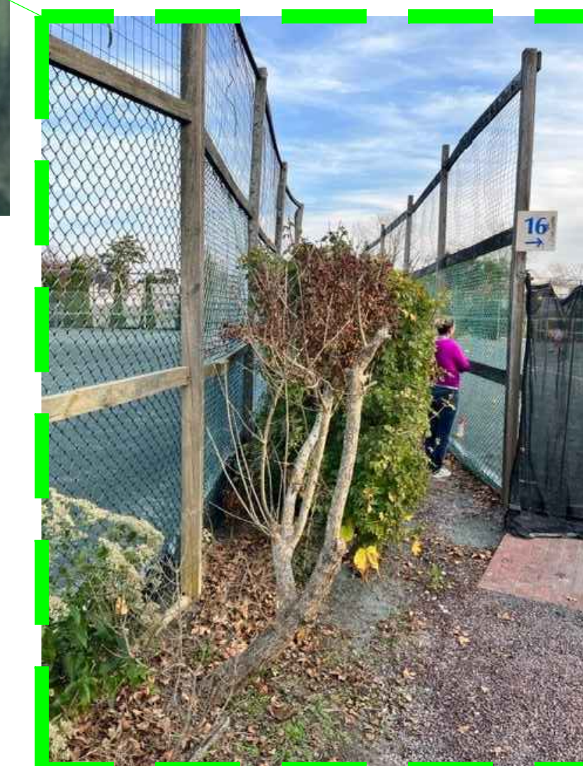
CONSTRUCT ADA ACCESSIBLE PATHWAY IN PRESENTLY VEGETATED AREA BETWEEN COURTS LEADING TO PRO SHOP & CLUB HOUSE