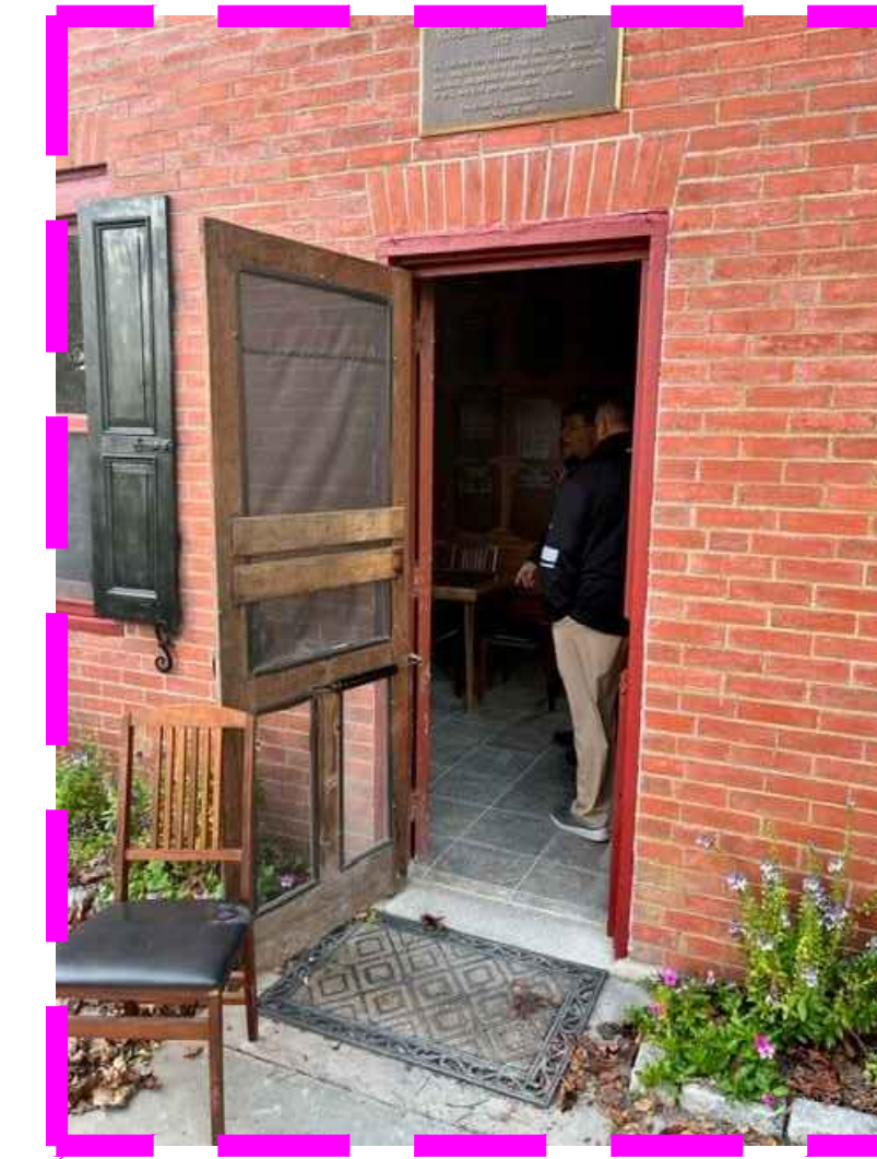
EXISTING CLUB HOUSE REPLACE EXISTING DOOR & ADD HANDICAP PARKING SPACE TO PROVIDE ADA ACCESSIBILITY